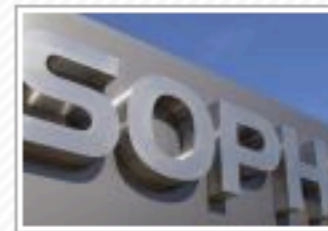
Sophos Introduces New and Enhanced Enterprise Products for Complete Protection Anywhere