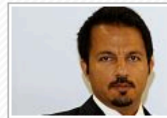
Secureway highlights future trends in networking world with special seminars at MECOM 2011