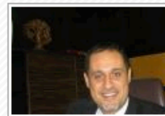
SpliceCom Signs Distributorship Agreement with SCOPE ME for Middle East