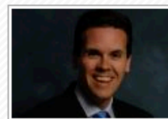
CommVault Announces New, Expanded Roles for Key Executives