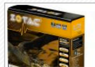
ZOTAC® Unveils New GeForce® GTX 560 Series